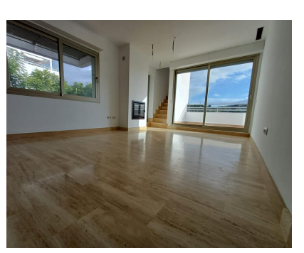
Ref.-ID: R4891588 La Cala Apartment