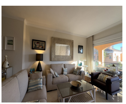
Ref.-ID: R4889758 Estepona