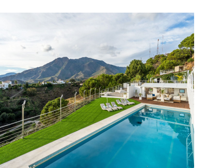
House Ref.-ID: R4875148 Estepona