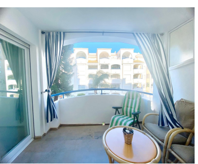
Ref.-ID: R4848943 Benalmadena Costa