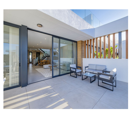
Cabopino Apartment Ref.-ID: R4830358