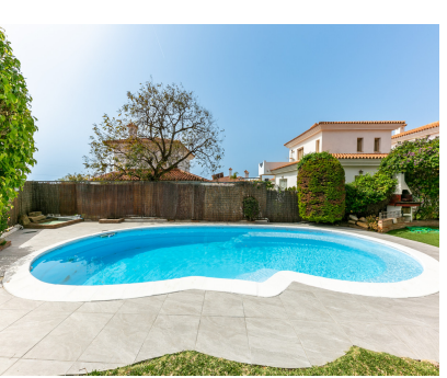
Fuengirola Ref.-ID: R4798207 House

Community: 1,080 EUR / year IBI: 1,320 EUR / year