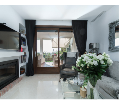
Ref.-ID: R4794145 Benahavís