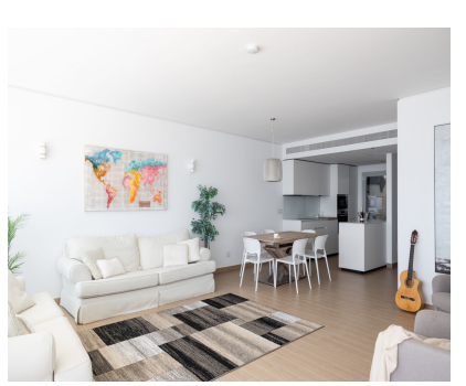
Ref.-ID: R4752718 Fuengirola