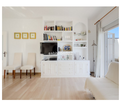
Ref.-ID: R4722538 Mijas Costa Apartment