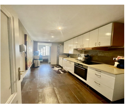
Ref.-ID: R4694791 The Golden Mile