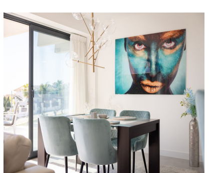
Ref.-ID: R4681270 Estepona Apartment