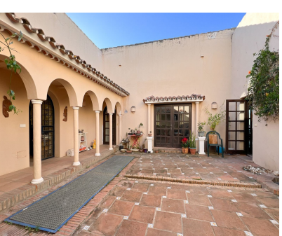
House Ref.-ID: R4597402 Estepona