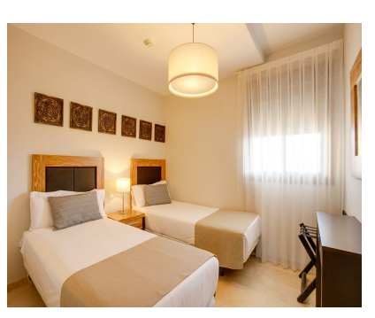
Ref.-ID: R4592863 Estepona Apartment