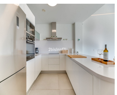
Ref.-ID: R4378327 Community: 6,888 EUR / year