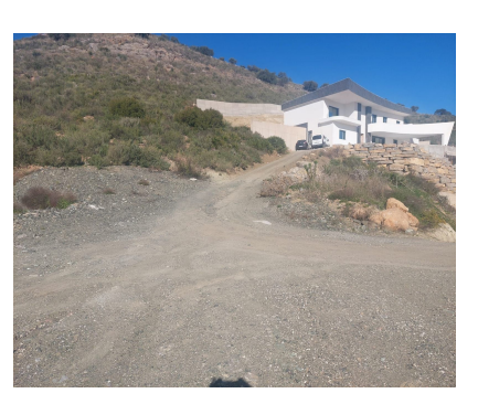
Ref.-ID: R4312843 Coín Plot