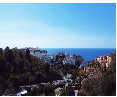
Ref.-ID: R4193743 Benalmadena Costa Plot