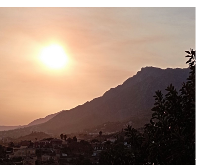
Río Real Ref.-ID: R4187251 House