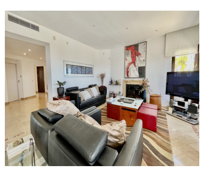
Río Real Apartment Ref.-ID: R4094857