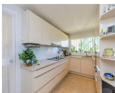
Ref.-ID: R3262951 Elviria Apartment